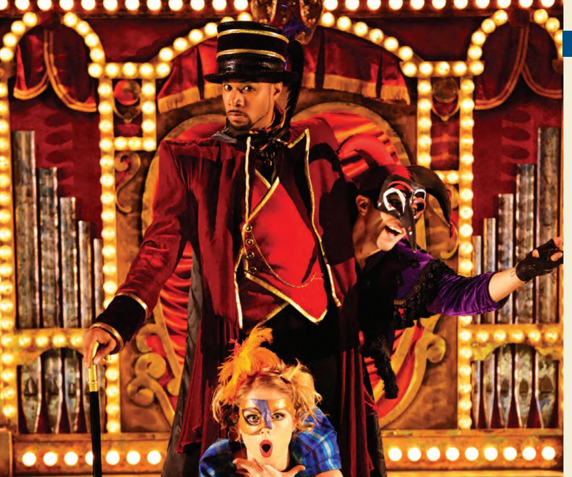
Left to right: Catch a Princess Theater musical like "Fiera!"; let the chips fall in the Casino

Movies Under the Stars, a Princess exclusive, brings you feature films, thrilling concerts and exciting sporting events, including live football, all on a giant screen poolside throughout the day and evening.