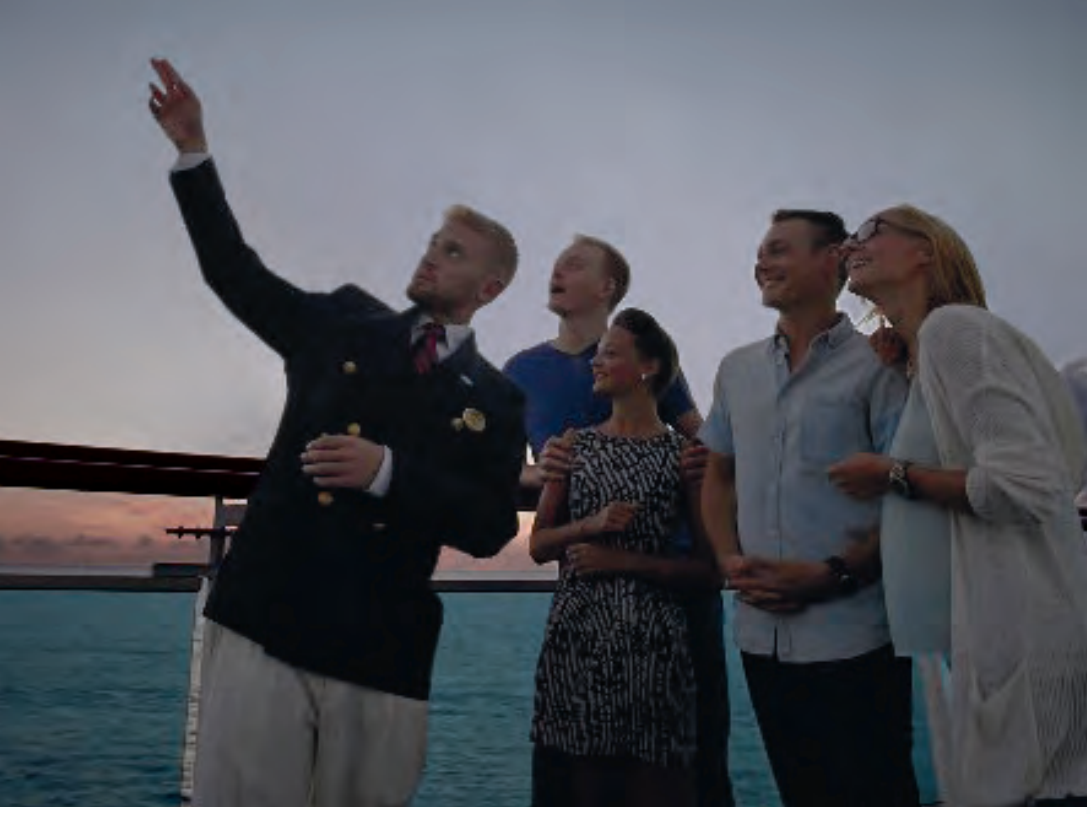
Above: Take in the night sky with Discovery at Sea