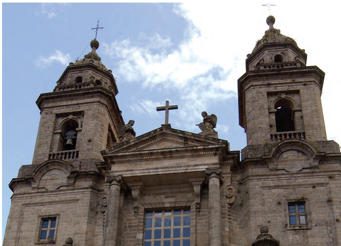
The Cathedral of Santiago, Chile

*Taxes, Fees and Port Expenses up to $595 are additional, subject to change, and Princess reserves the right to collect any increases in effect at the time of sailing even if the fare had already been paid in full. Certain restrictions apply. See page 6 for details.