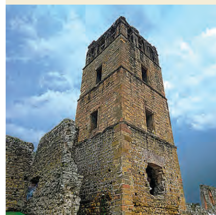
Top to bottom: An up-close view of the Panama Canal; the ruins of Panama Viejo