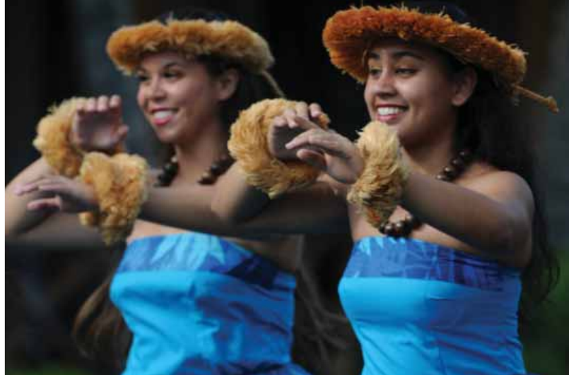
Left to right: Pacific Princess in Venice; The wonderful Hawaiian tradition of hula dancing