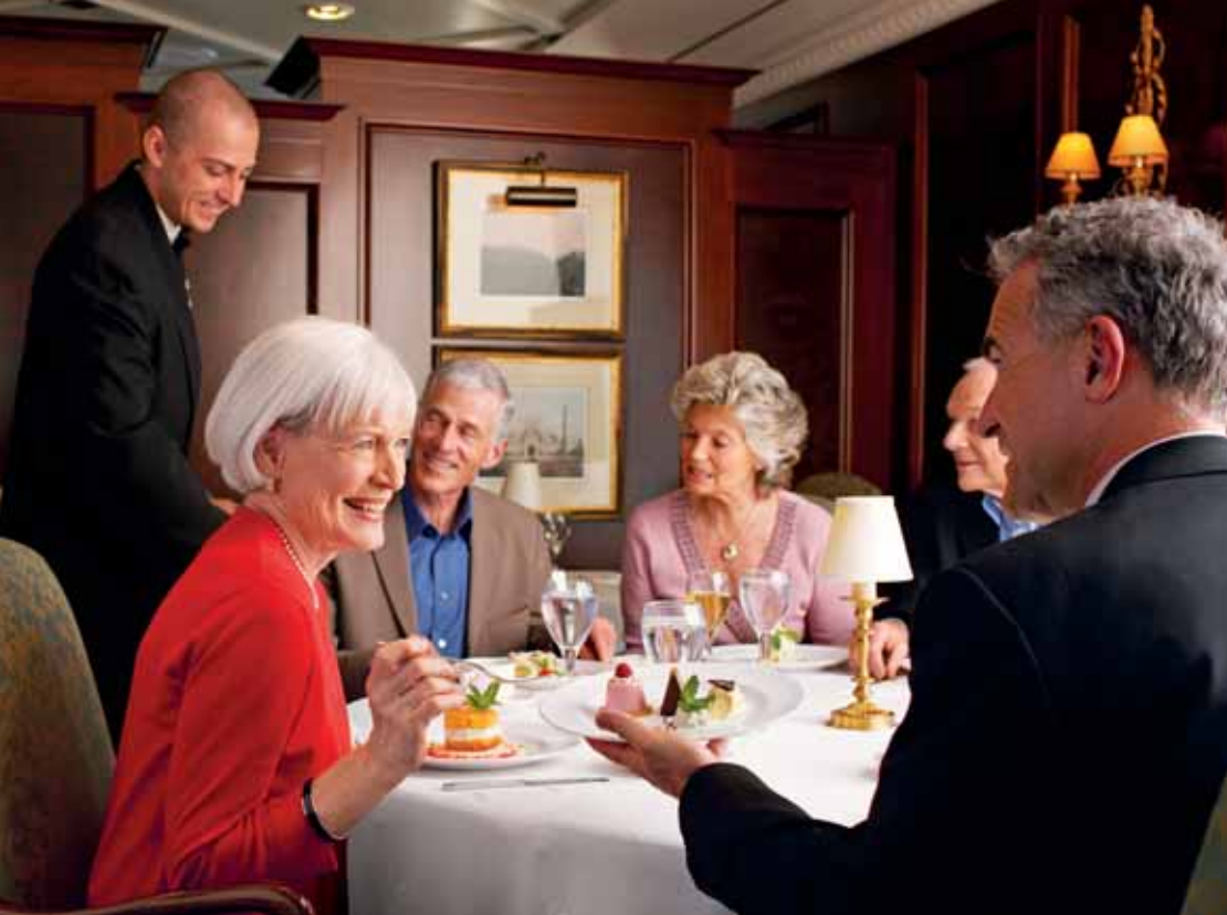
Left to right: a tantalizing Italian dinner with friends at Sabatini's; Princess Seawitch West Coast IPA; delectable Norman Love chocolates