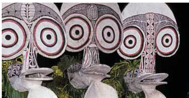
Clockwise from upper left: Historic Valletta on Malta; Australia's famous tree dweller, the cuddly koala; tropical Cochin on India's coast; colorful traditional masks in Papua New Guinea; the Merlion, an iconic symbol of multifaceted Singapore; the inviting Sea of Cortez coastline at La Paz